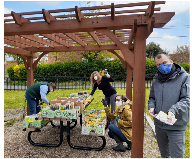
Seed distribution event at Arlington’s Four Mile Run Community Garden.

When COVID-19 hit, the Agriculture and Natural Resources agent and volunteers extracted these seeds from storage and facilitated socially distanced seed distribution events at community gardens, created an online seed request form, and established three neighborhood distribution sites for seed pickup. They distributed 10,500 seed packets to 1,250 recipient families. One recipient wrote, “Although it was the first year of planting and during a pandemic year, these seeds gave a long-lasting burst of color to brighten everyone’s day! Bright yellow marigolds, pink coreopsis flowers, and an array of colorful zinnias in 66 planters helped spread joy. It was a pleasure to see how a handful of seeds can nurture a caring community.”