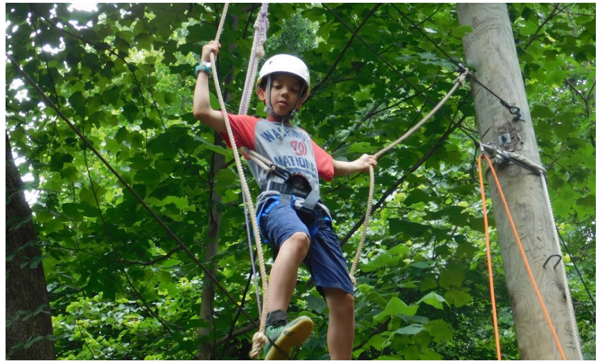
4-H Camp encourages youth to overcome fears and face new challenges in a safe, supportive environment.

Each year, Arlington, Alexandria, and Fairfax 4-H partner to send approximately 130 youth to overnight 4-H Camp. Supervised by trained teen counselors, campers spend a fun-filled week trying new activities like archery, canoeing, and ropes courses. Each day includes pool time, team building, and a roaring campfire. Throughout this action-packed week, youth build life skills. After camp, the percentage of youth who reported that it was easy to try new things increased from 62% to 77%, and the percentage who said it was easy to express their opinion increased from 62% to 80%. One teen remarked that camp taught her “how to help younger children and be a leader,” and another reported that he “gained confidence in working with others.”